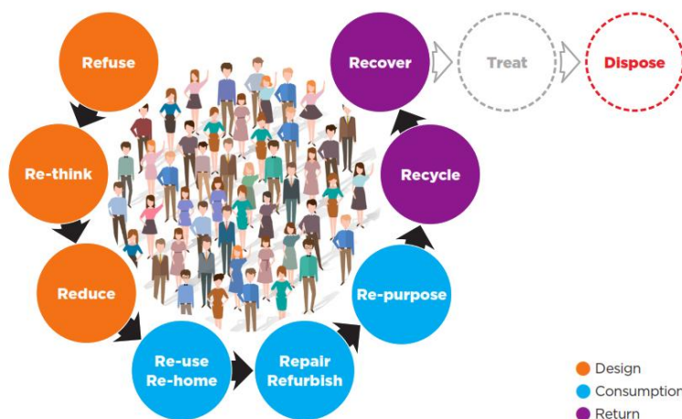
Figure 1: 8R Circular Economy Model

Thermal energy from waste (EfW) is the second last option in our 8R circular economy model before landfill (Figure 1). Bayside Council does not support new landfills.