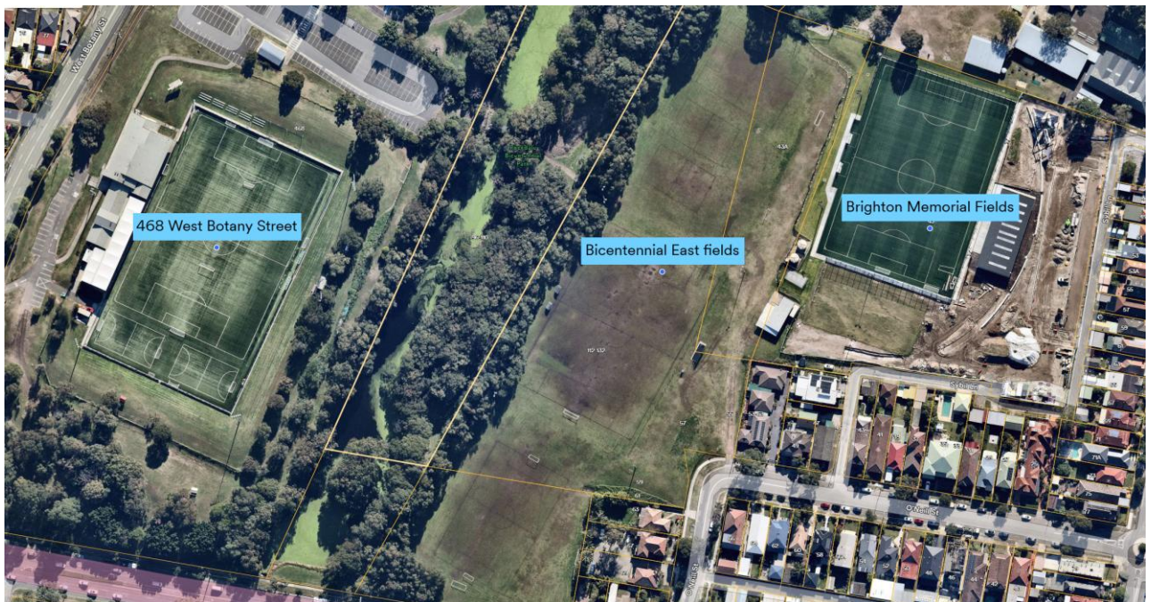
Historic Aerial Photo (Near map June 2021)

The position put to the Club is to wait until there is certainty about the handback of Bicentennial East. At that point Council can reassess which user group(s) ought to be allocated various fields and whether it is beneficial to the broader community to have multiple and/or shared or casual usage.