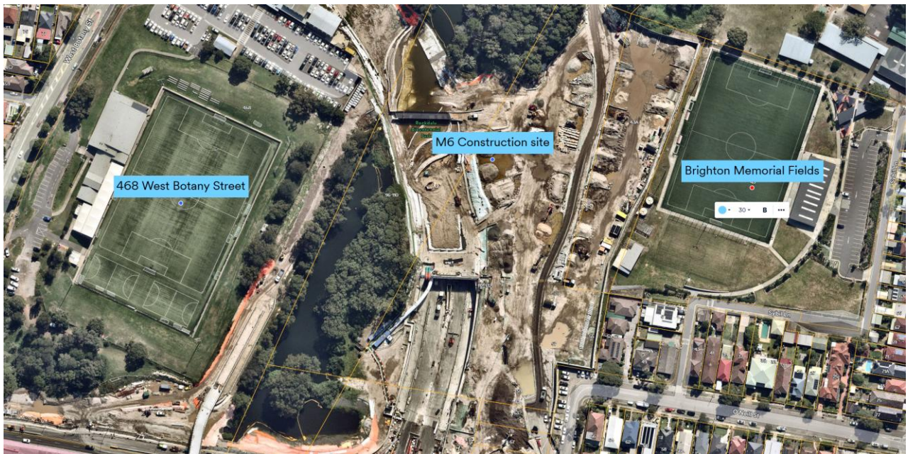
Current Aerial Photo (Near map April 2025)

Some of the area resumed by TfNSW will be occupied by the tunnel portal for the M6. The land between the tunnel portal and Memorial will be reinstated as parkland, an active transport corridor, and two turf playing surfaces smaller than full size fields. This space could be configured a number of different ways in terms of field sizes. The timing for the handback of this area to Council is currently unknown and under review, following the delay of the M6 project due to the sinkholes adjacent West Botany Street.