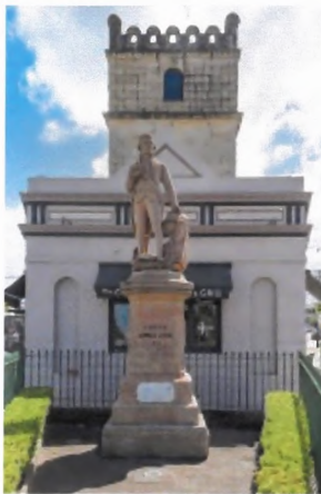
Captain Cook's Statue Randwick

This contribution considers the current debates about the place of monuments, such as the statue of Captain Cook in Hyde Park, which reached a recent high point during the Black Lives Matter protests across Australia in mid 2020. While removing contentious statues from public view may address concerns about their unwanted presence, we must ensure that the contested history they embody is not also erased from society's memory. We need to develop an acceptable framework for dealing with such monuments within their historical context. Ultimately, there is no single answer to the question: should the vestiges of flawed historical narratives stay or go? It depends on the circumstances of each case. But some things are clear. There is a need for Australia to redress historical and current wrongs against First Nations people.