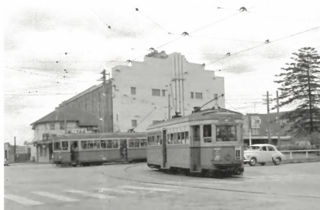
Vocalist Theatre 737 Anzac Parade, Maroubra Junction, NSW https://cinematreasures.org/theaters/39807/photos/383578